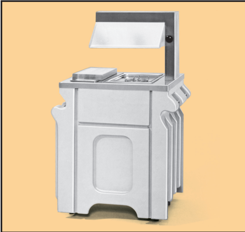
U.S. Patent No's. 4,013,880 and 4,008,931