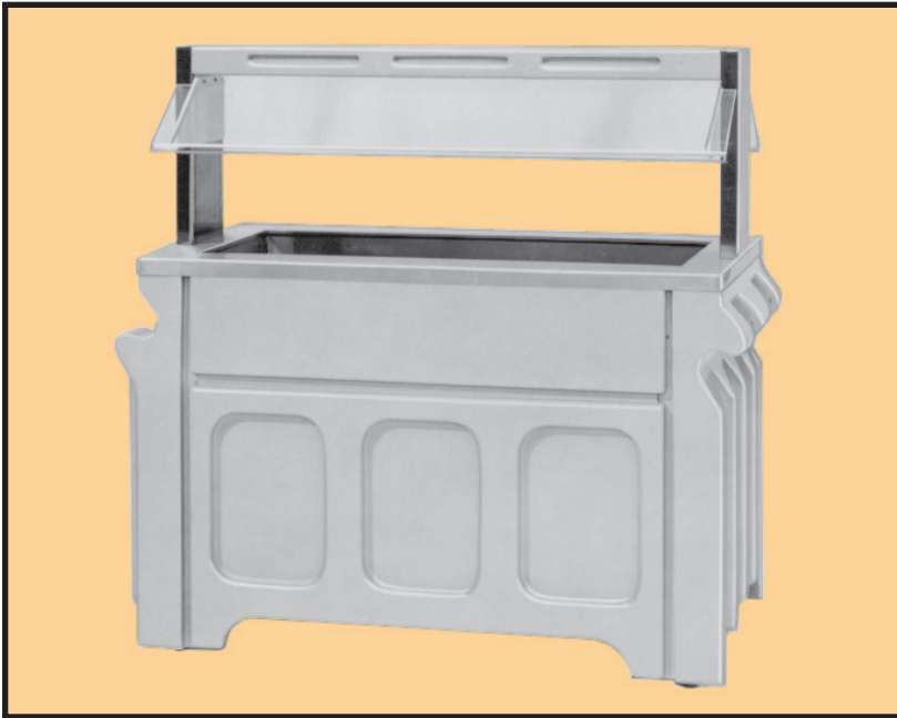
U.S. Patent No's. 4,013,880 and 4,008,931